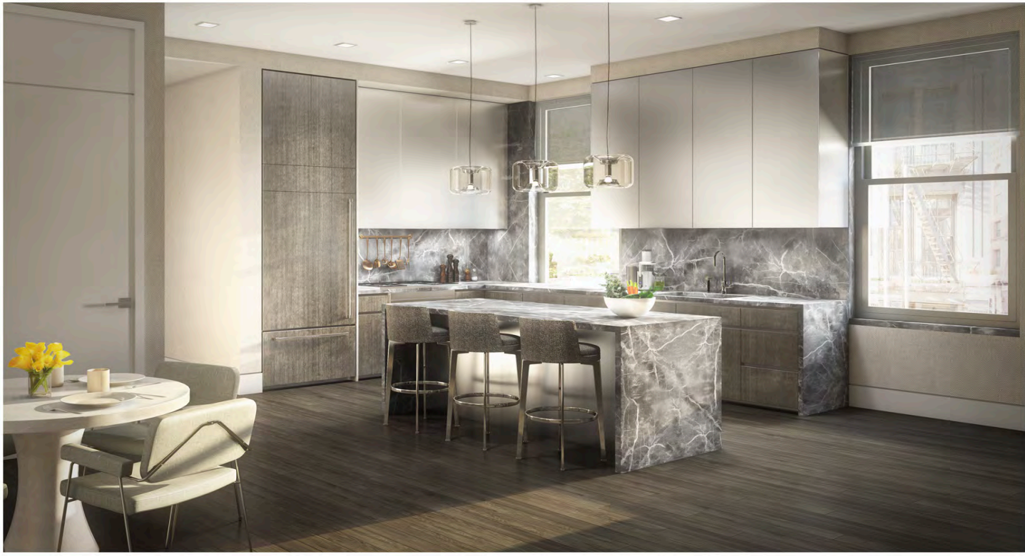
The building is part of the area's historic cast-iron district and features interiors by Grade