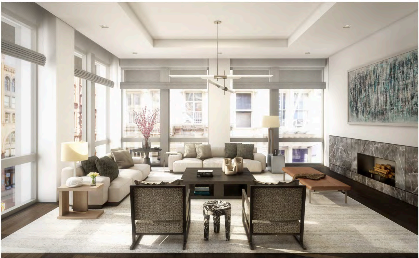
The building includes three- and four-bedroom loft-like apartments