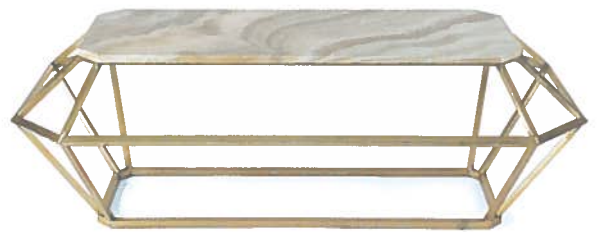
Baguette coffee table. Image by John Coolidge